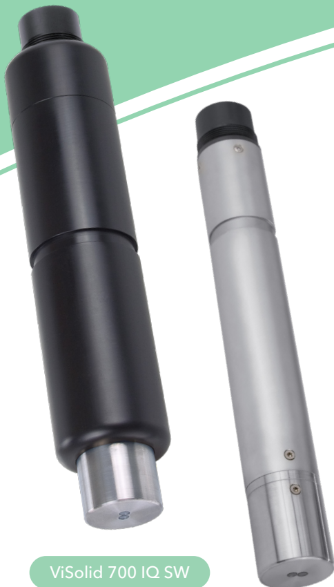
ViSolid 700 IQ SW

OPTICAL TOTAL SUSPENDED SOLIDS SENSOR FOR IQ SENSORNET